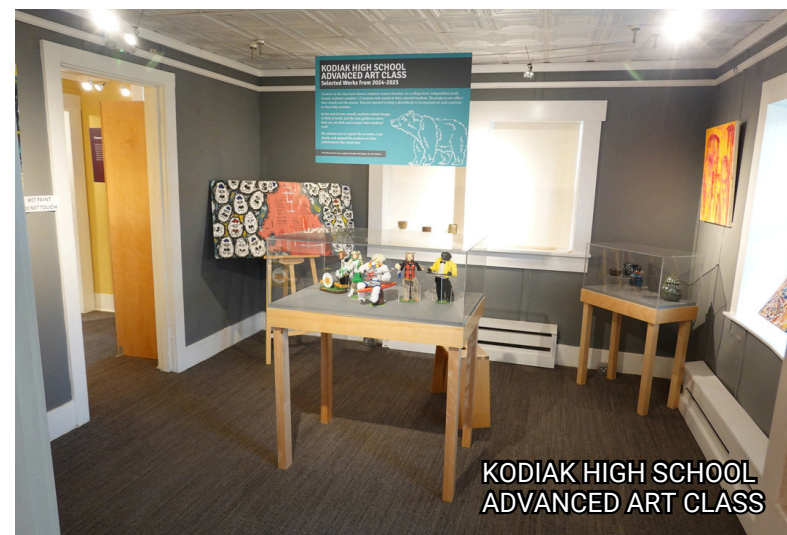
KODIAK HIGH SCHOOL ADVANCED ART CLASS

A returning partnership between Kodiak High School's Advanced Art Class and KHM displayed works created by Kodiak's up and coming artists.