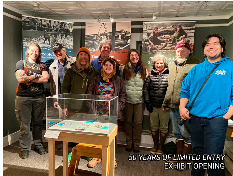
50 YEARS OF LIMITED ENTRY EXHIBIT OPENING